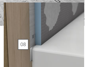
Tub Installation with Tub Sealing Tape